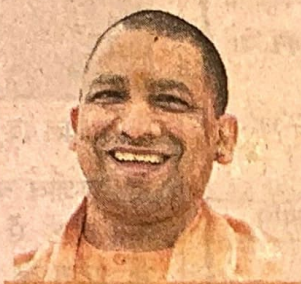
Yogi Adityanath Chief Minister, Uttar Pradesh