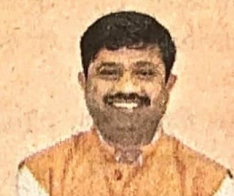
Nand Gopal Gupta 'Nandi' Minister of Industrial Development Uttar Pradesh